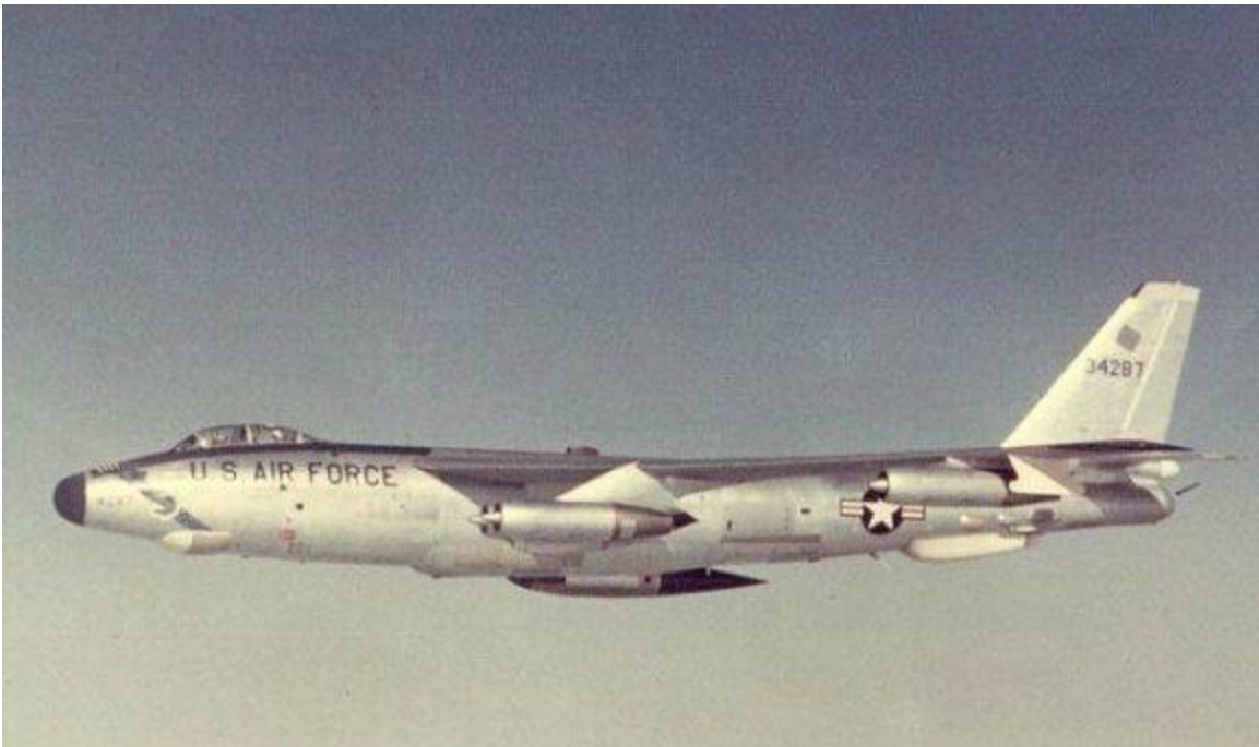
RB-47H - Same model as we flew out of Thule AB

In the winter of 1956-57 one RB-47H aircraft supported by KC-97 tankers made Top Secret polar flights out of Thule AB Greenland (as depicted below) to inspect Russian defenses. Five KC-97s prepared for flight with engines running in weather 50°F below zero in order to ensure three got airborne. After a two-hour head start for the KC-97s, our RB-47 would catch up with them at the northeast coastline of Greenland where two would offload fuel to top off our tanks (The third was an air spare). We would then fly about seven hours of reconnaissance, while the tankers would return to Thule, refuel, and three would again fly to rendezvous with us upon returning at NE Greenland. We averaged about ten hours and 4500 nm in the air, unless unpredictable weather closed Thule as it did on this mission.