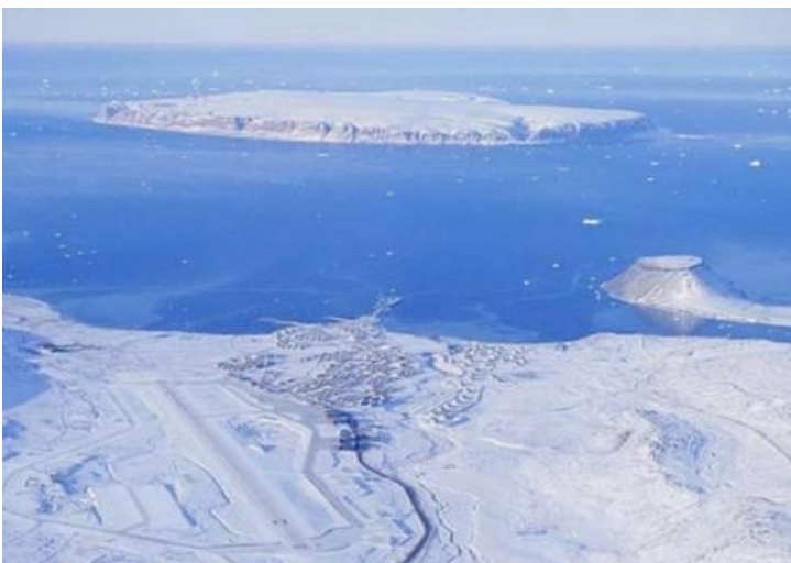
<<< Thule AB, Greenland

Thule, Greenland, is the home where the fastest sea level surface wind speed in the world was measured when a peak speed of 333 km/h (207 mph) was recorded on March 8, 1972. Interestingly, Thule is the only Air Force Base with an assigned tugboat. The tugboat is used to move icebergs that appear off the coast that may interfere with the flight path of incoming and outgoing flights.