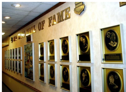
The wall as shown full length, located just outside the 55th Wing Command Section

Nominations were due to the 55th Wing Association Awards Committee by the end of December 2014.