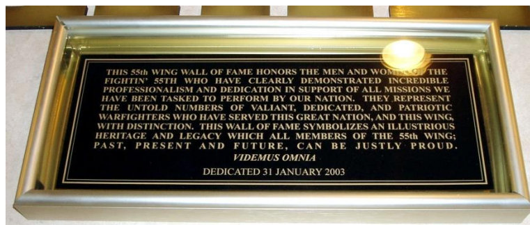
This plaque is posted above the mural at the center of the Hall of Fame plaques of inductees.