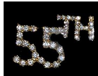
(Shown actual size)

The pins continue to be sold to Association members all over the country. They are particularly evident at official and social functions at Offutt, and at 55 th reunions.